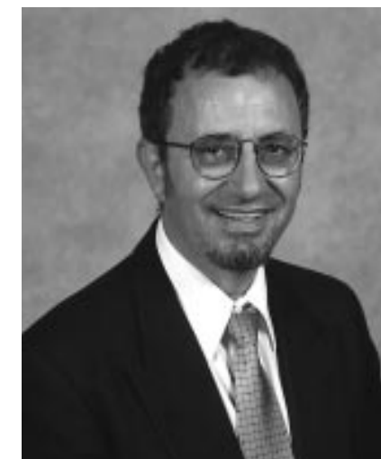
Hon Theo Theophanous New Minister for Energy Industries and Resources

From the Minister for Energy Industries and Resources - Theo Theophanous